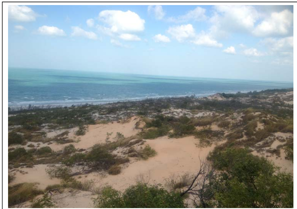
Figure 3. Pleistocene age barchan dunes at Kilimiraka EL24329

In many instances the Tertiary sea cliffs are preserved from further erosion by accumulations of Pleistocene and/or Holocene littoral deposits. The Pleistocene sands are distinguishable from their Holocene counterparts by a mild orange, pink or red discoloration, and are invariably developed as one or more low amplitude, but strike persistent strandlines, with a wavelength characteristically in tens, rather than hundreds, of metres. However an exception to this is the Kilimiraka Sand dunes on the South Coast of Bathurst Island which due to the significant wind regime has a series of large barchan dunes of Pleistocene age.