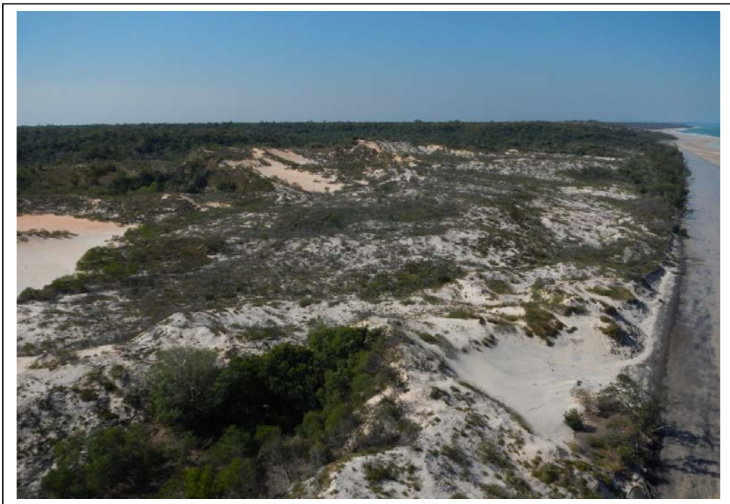
Figure 4. Tingati Barchaan Dunes – South West Bathurst Island – an environmental and logistically challenging prospecting target

In addition the Annual Environment Report & Mine Closure Rehabilitation Plan for the 3 MZI Mining Leases adjacent to EL23862 was also completed in October 2017 and has been filed with the department.