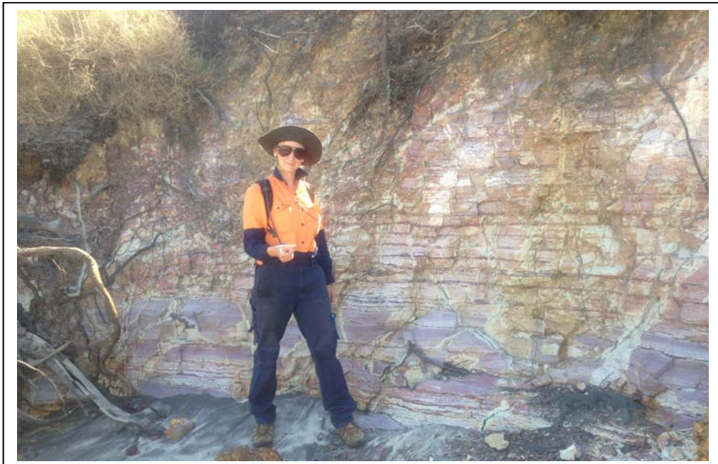
Figure 2. Book leaves of kaolin (Moonkinu Member) at high tide mark on the south coast of Bathurst Island EL24329.

The oldest rocks exposed on Bathurst and Melville Islands are represented by the Upper Cretaceous Moonkinu Member (Hughes, 1977). This formation consists of fine to very fine sub-labile sandstone, along with interbedded grey carbonaceous mudstone and siltstone, of shallow marine to deltaic derivation. The Moonkinu Member is exposed at the base of coastal cliffs (figure 2), particularly along the southern coastline of Bathurst and Melville Islands, and in lower lying portions of the hinterland.