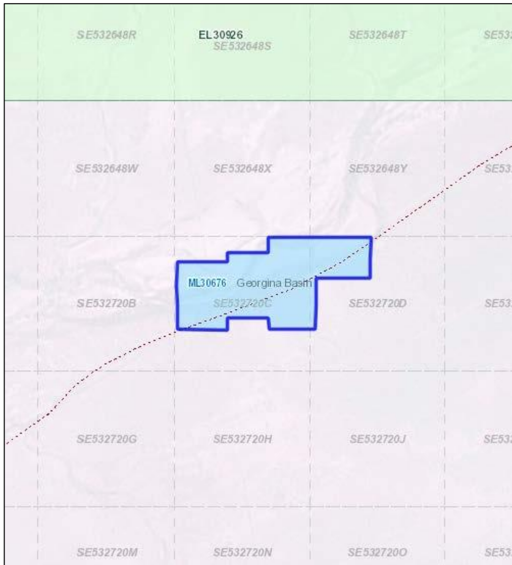
Figure 2: Tenement Map