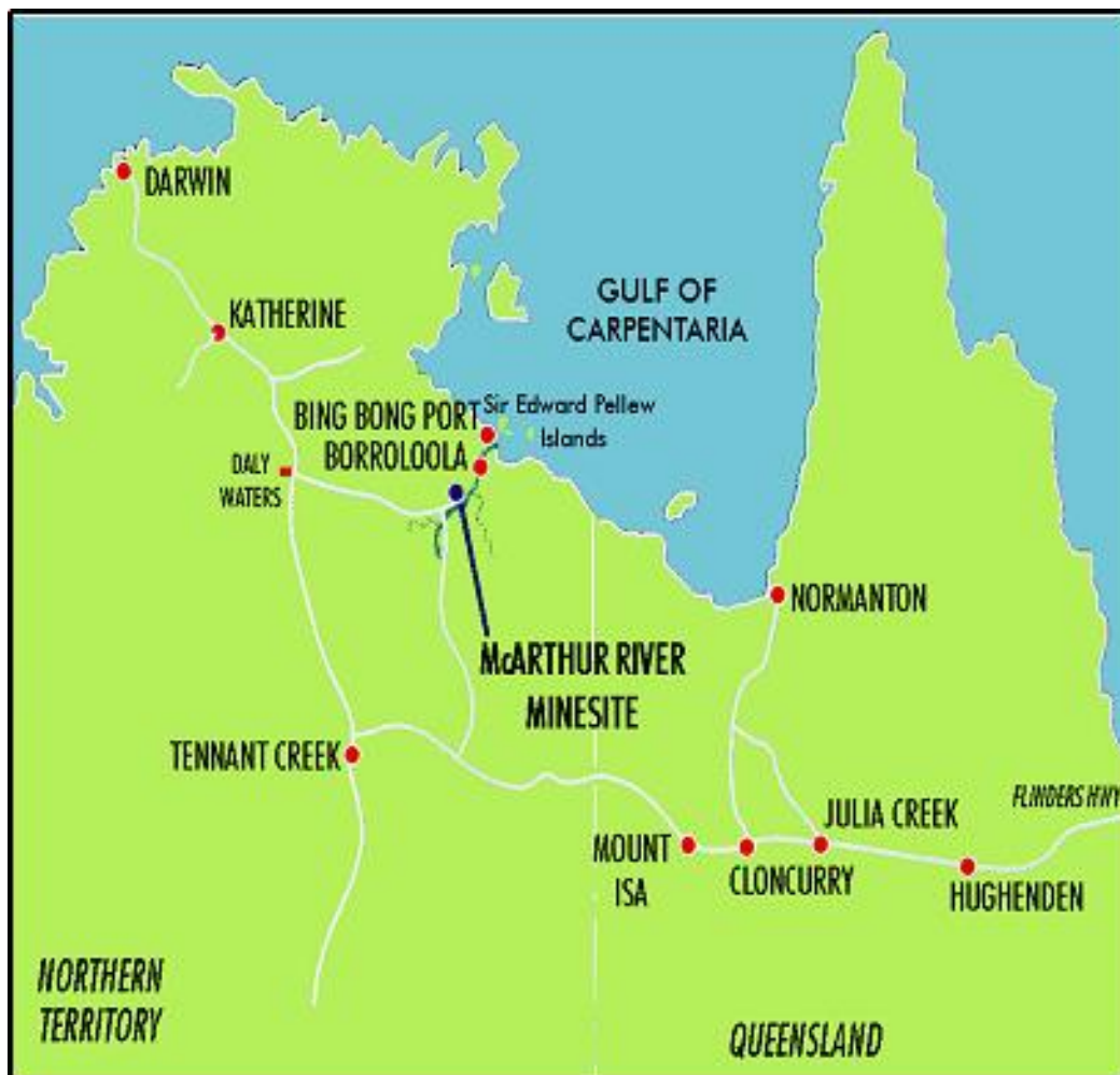
Figure 1: Bing Bong port and McArthur River Mine site location (Grenfell, 2012)

The McArthur River Mine is located 70 kilometres south west of the township of Borroloola in the Gulf Region of the Northern Territory, approximately midway between Darwin and Mount Isa. Bing Bong Port lies within the Gulf of Carpentaria close to the Sir Edward Pellew Islands. (Figure1). MLN1126 was granted in 1993.