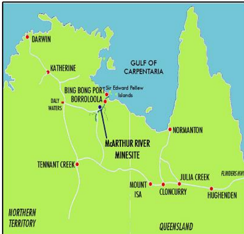
Figure 1: McArthur River Mine site location (Grenfell, 2012)

The McArthur River Mine is located 70 kilometres south west of the township of Borroloola in the Gulf Region of the Northern Territory, approximately midway between Darwin and Mount Isa (Figure1).