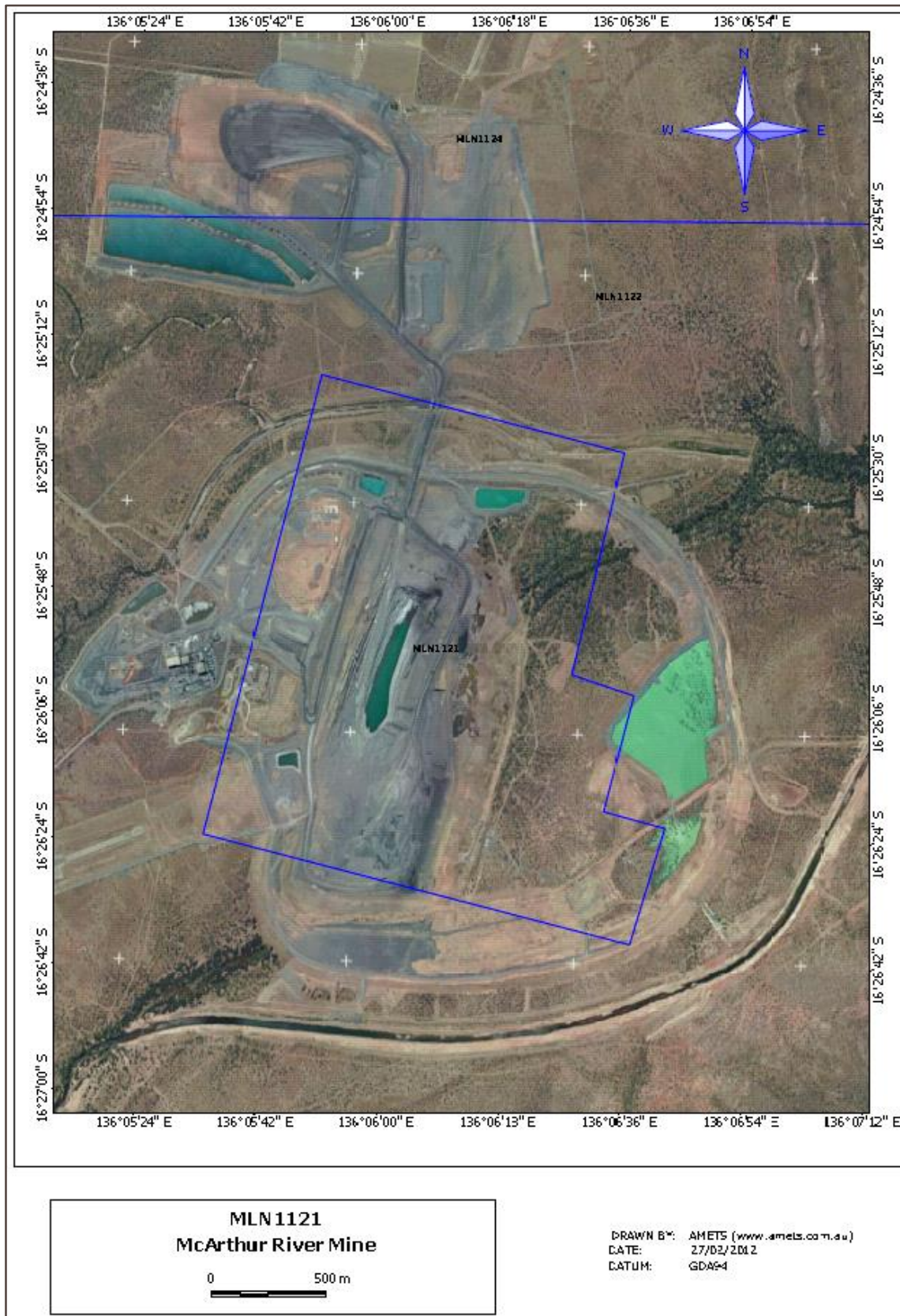
Figure 3: MLN1121 with aerial photograph backdrop