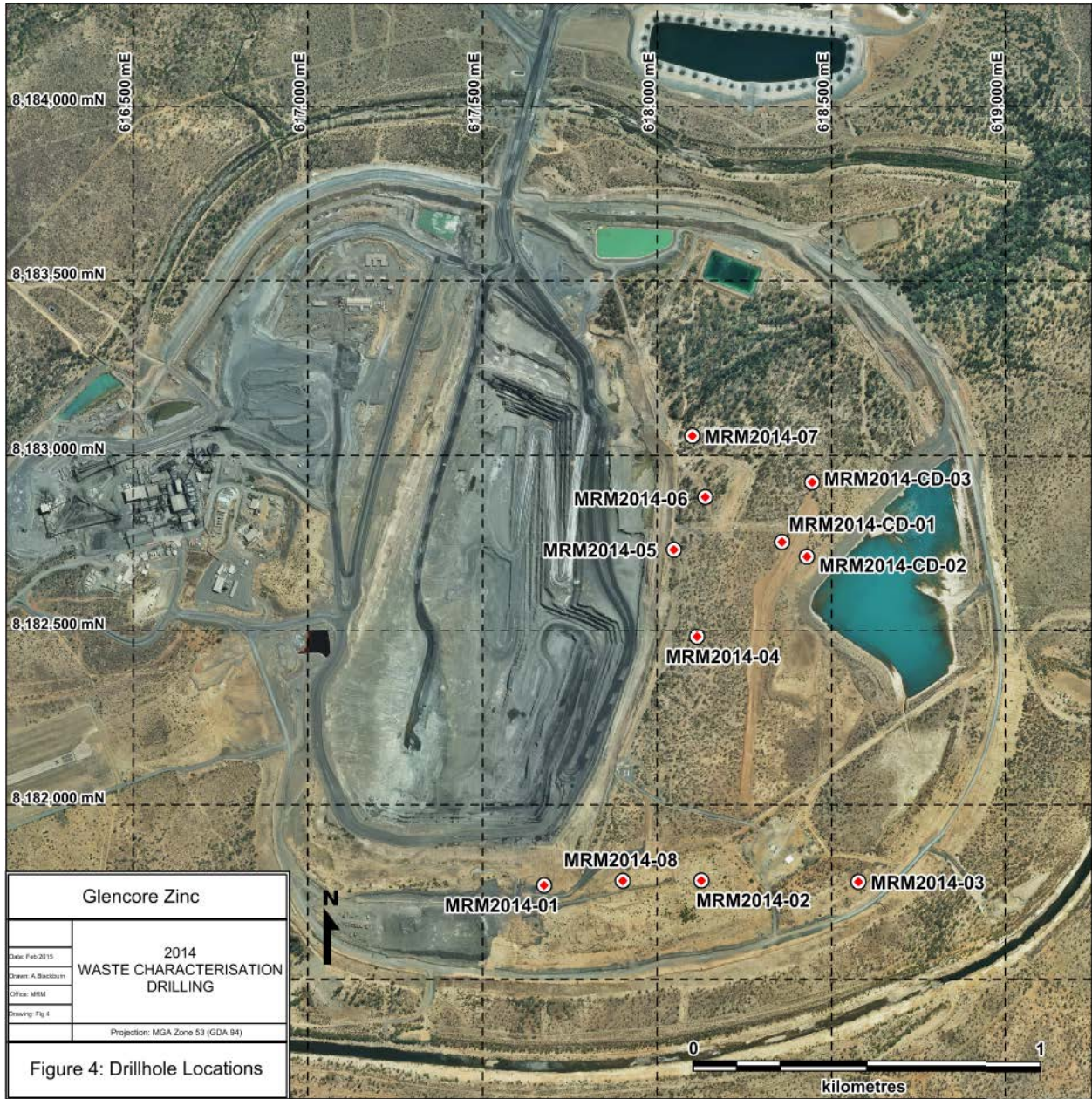
FIGURE 4: 2015 WASTE CHARACTERISATION COLLAR LOCATIONS - PROJECTION MGA ZONE 53 (GDA 94)