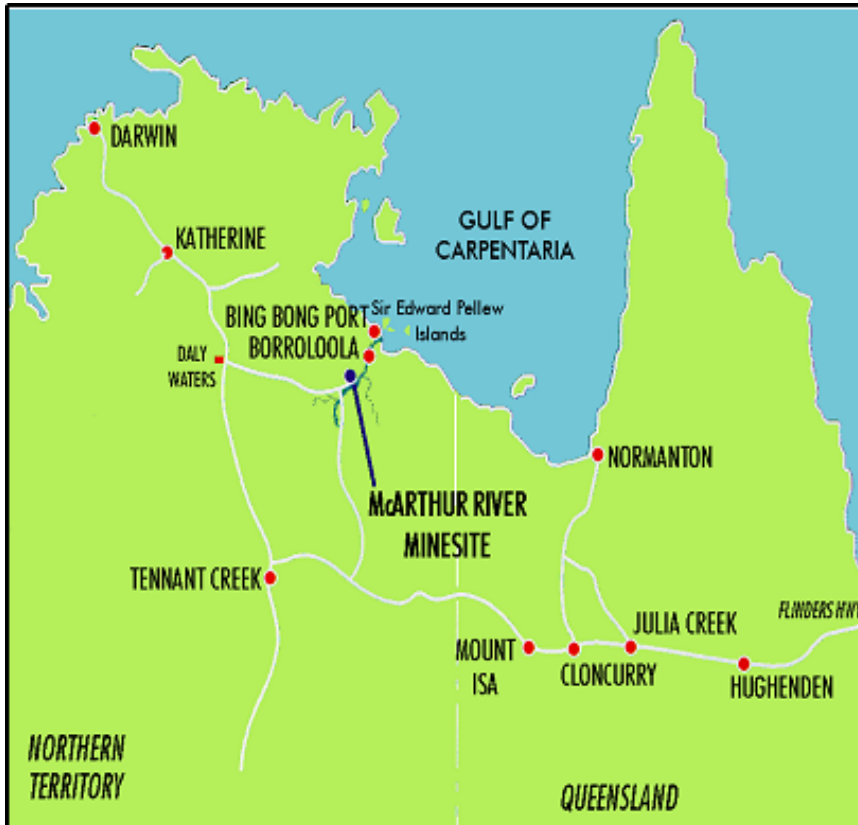
FIGURE 1: MCARTHUR RIVER MINE LOCATION (GRENFELL, 2012)

The McArthur River Mine is located 70 kilometres south west of the township of Borroloola in the Gulf Region of the Northern Territory, approximately midway between Darwin and Mount Isa (Figure 1).