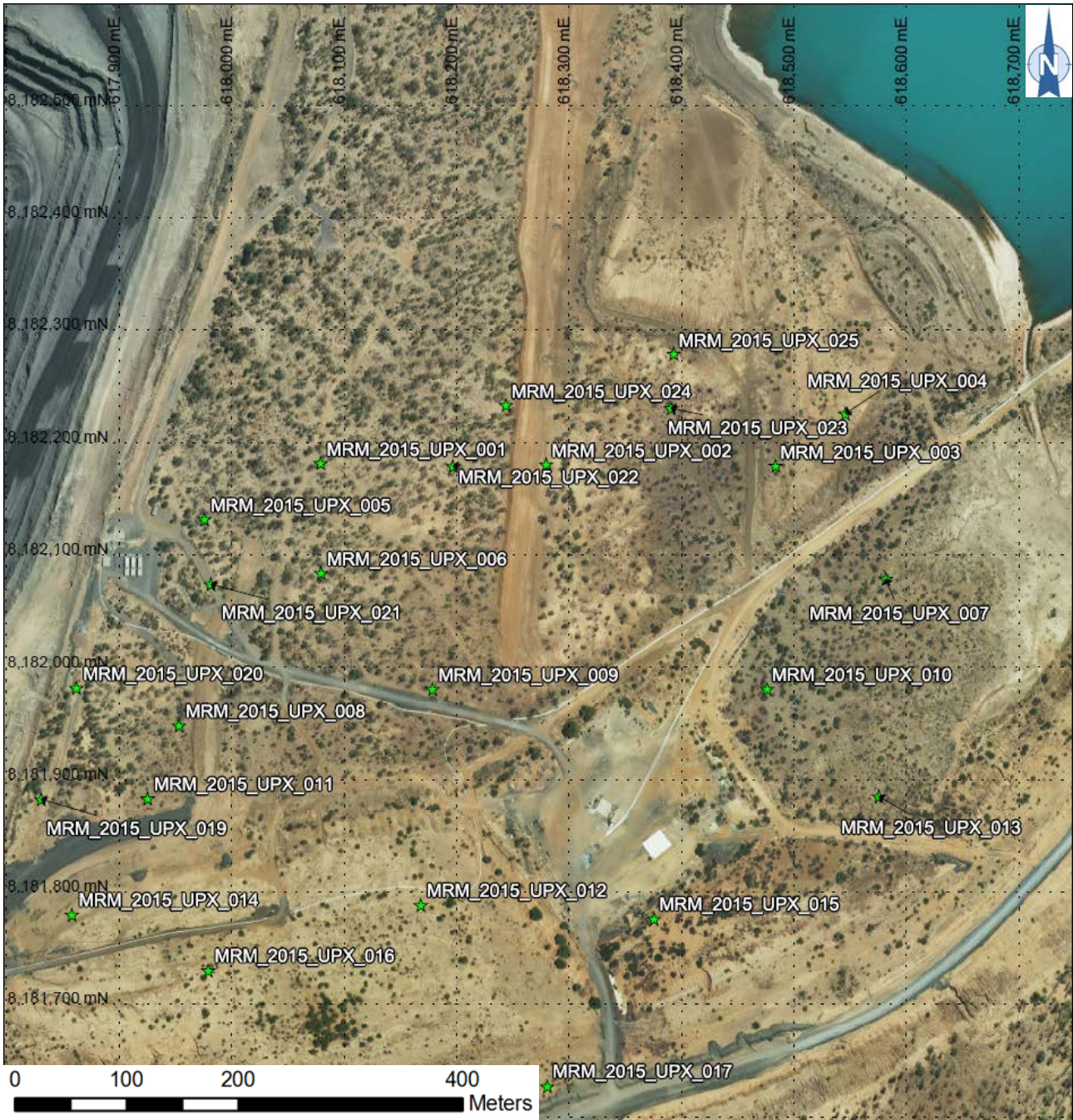
FIGURE 5: 2015 WASTE CHARACTERISATION COLLAR LOCATIONS - PROJECTION MGA ZONE 53 (GDA 94)