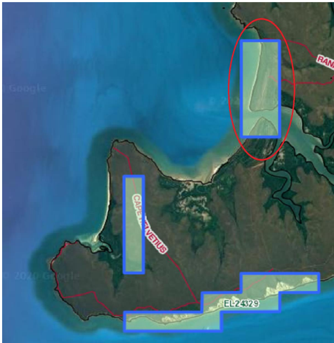
Figure 3. Location of relinquished blocks for EL24329 (circled red)