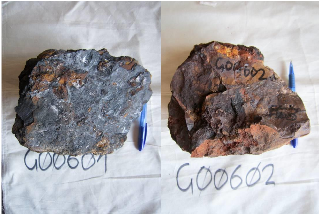
Samples G00601 and G00602: Fe + Mn mineralisation.

All 4 samples were submitted to ALS Laboratories for a calculated bulk density analysis from wet/dry method, specific gravity measurements (OA-GRA09s). The 2 mineralised samples were assayed for Fe, Mn, Al, Ba, Ca, Cr, K, Mg, Na, P, S, Si, Sr and Ti by fused disc XRF (ME-XRF26s).