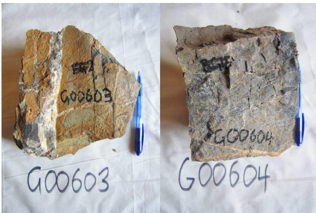
Samples G00603 and G00604: Dolomite from gravity anomaly area.