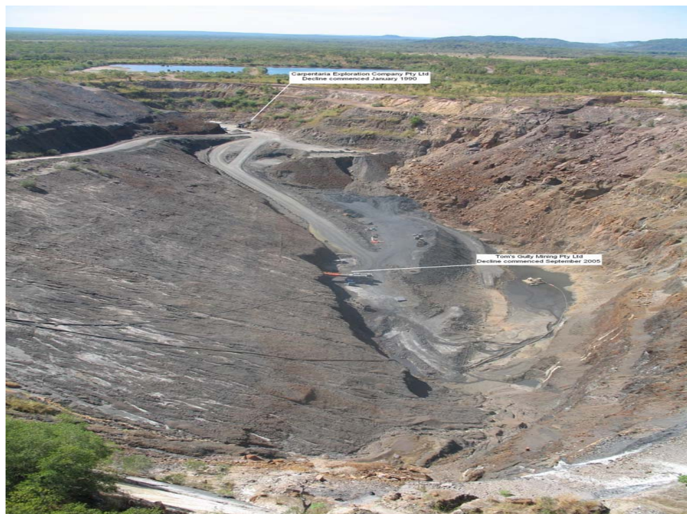
Figure 3: Toms Gully open pit showing location of CEC/MIM portal east of the Crabb Fault and newer Tom's Gully Mining Pty Ltd, portal cut into the footwall between the Crabb and Williams Fault. Photo taken from western edge of pit looking

An operating company, Tom's Gully Mining Pty Ltd, formed under an Alliance Agreement between Renison and PT Petrosea Tbk (a subsidiary of Clough Engineering Ltd) recommenced underground mining in September 2005 with a 5m x 5.3m portal cut into the footwall of Toms Gully open pit. The position of the portal, between the two major faults (Crabb to the east and Williams to the west) differed to the original decline of Carpentaria Exploration Company Pty Ltd (CEC), a wholly owned subsidiary of Mount Isa Mines Ltd (MIM) which commenced in January 1990 from the east end of the open pit and progressed well until the Crabb Fault Zone where development was stopped 465 metres from the portal in December 1990 (Figure 3). By December 2006 the Tom's Gully underground decline had progressed 644 metres and more than 700 metres of ore strike development had been completed. A further ~450m has also been completed in stockpiles, substations, ventilation drives, pumping stations, sumps, ore access drives and the magazine.