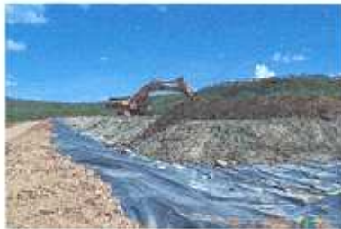
Relocation of transitional ore onto plastic