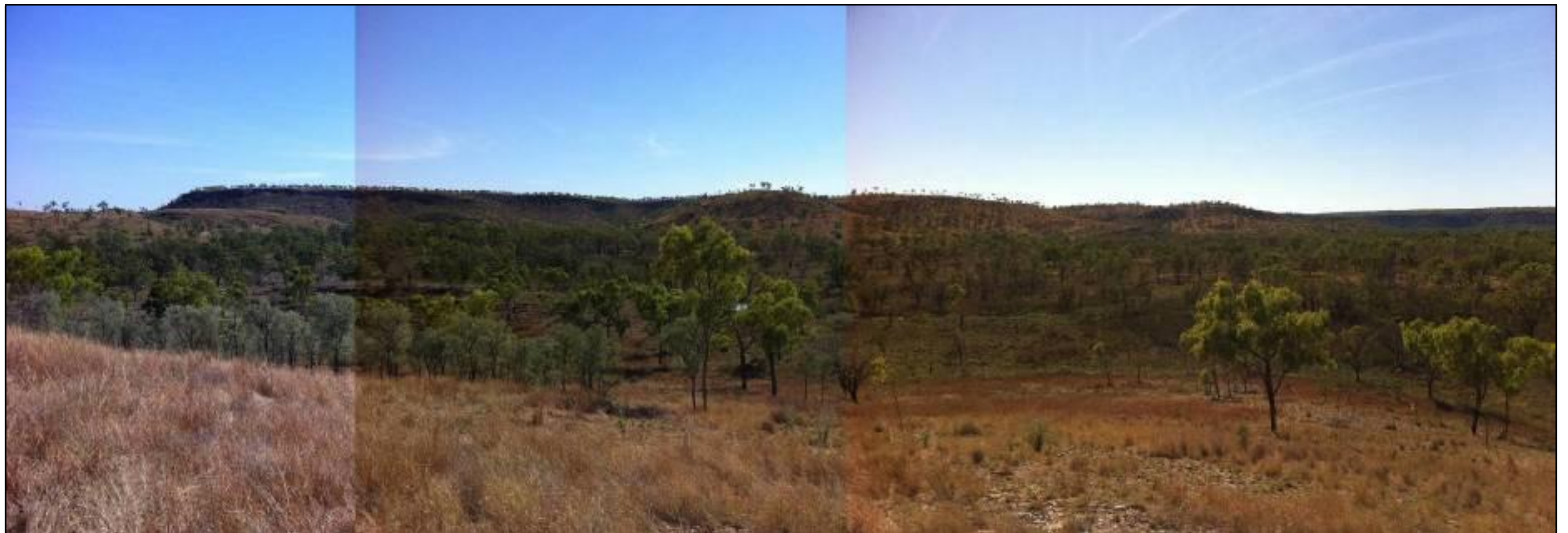
Distant View of Strata Above Barney Creek Formation, Including Reward Dolomite (panoramic view to northwest down dip-slope of Barney Creek Formation to north of previous photograph).