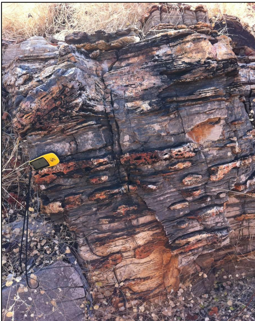
Reward Dolomite (at 579928E 8144584N [MGA Zone 53 (GDA94)])