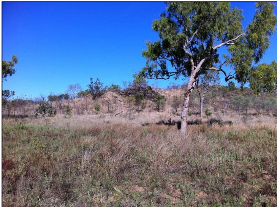
Teena Dolomite (view to south)