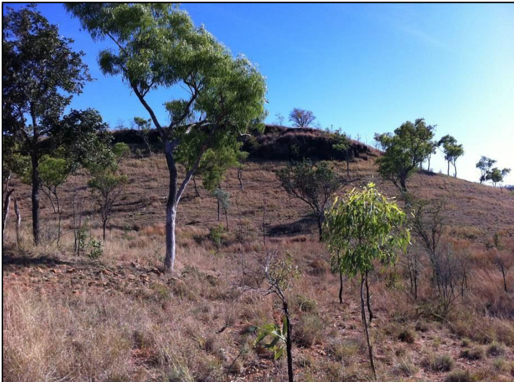
Barney Creek Formation (view to north from 578804E 8143758N [MGA Zone 53 (GDA94)])