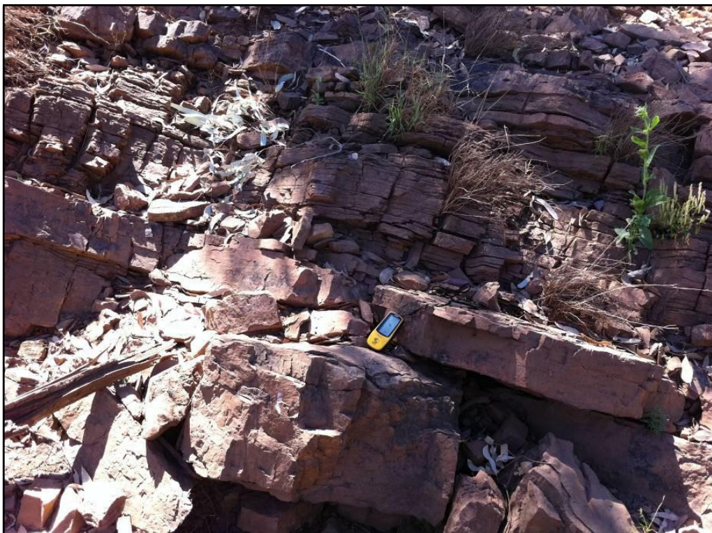
Shale unit near top of Barney Creek Formation (at 580311E 8144277N [MGA Zone 53 (GDA94)])