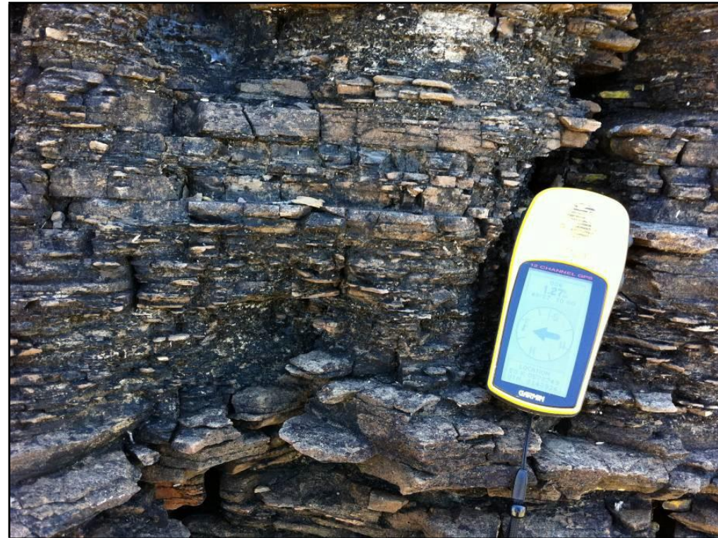
Barney Creek Formation (at 578749E 8143926N [MGA Zone 53 (GDA94)])