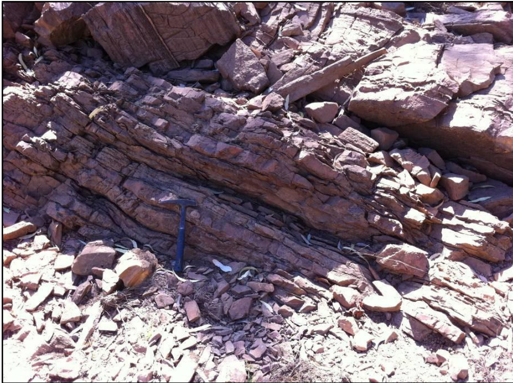
Thin shale unit in upper Barney Creek Formation (at 580931E 8144268N [MGA Zone 53 (GDA94)])