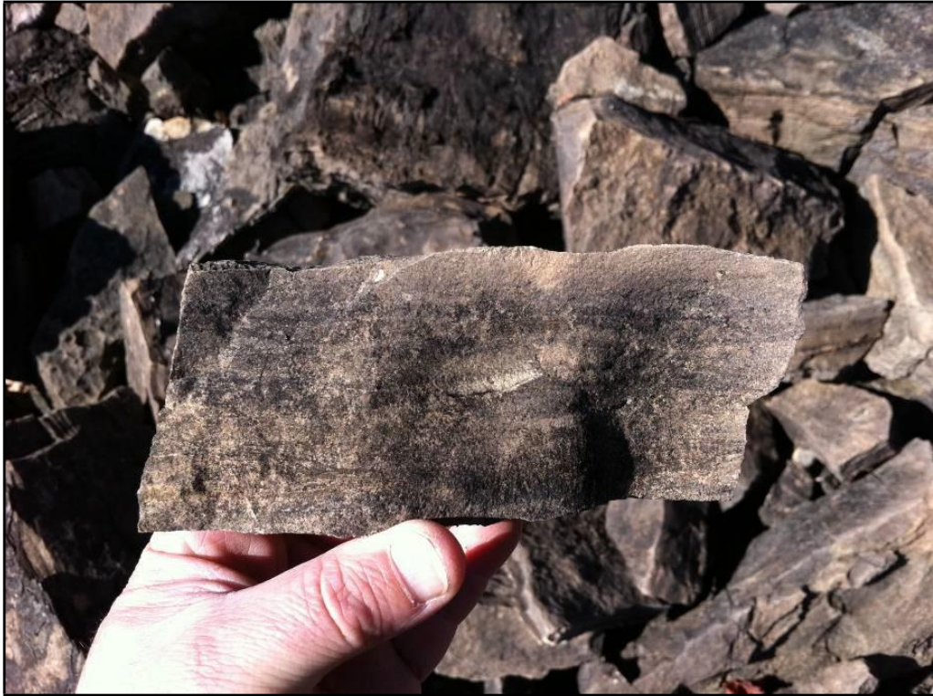
Hand Specimen of Teena Dolomite (at 578804E 8143758N [MGA Zone 53 (GDA94)])