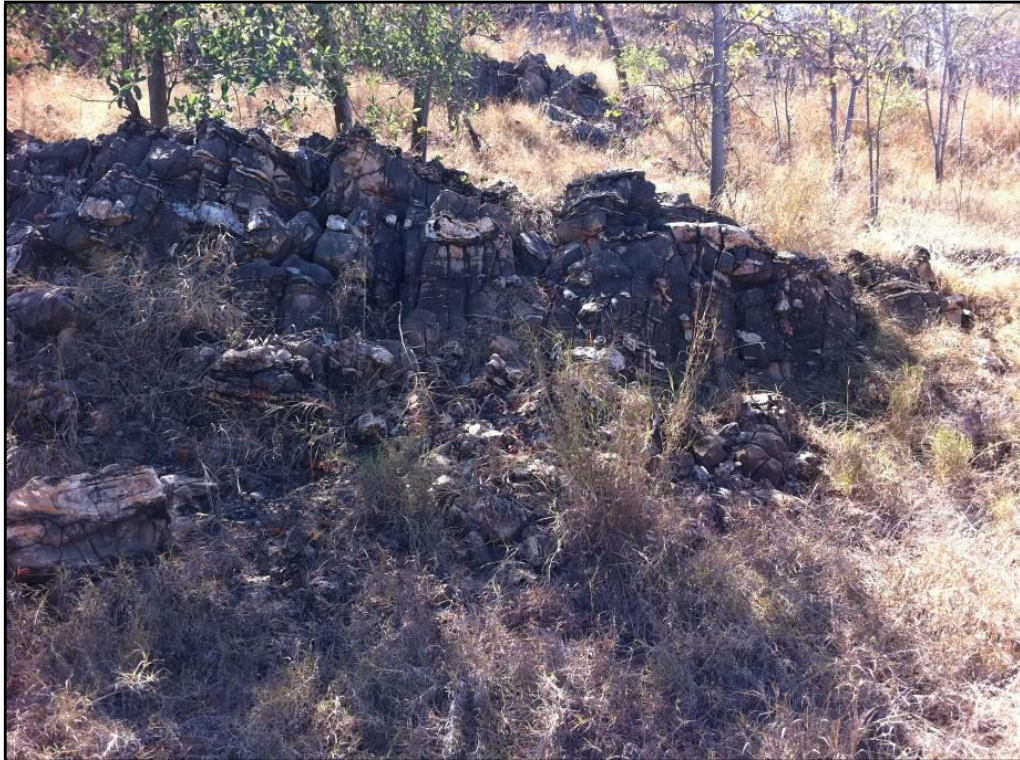
Reward Dolomite (view to northeast at 580099E 8144390N [MGA Zone 53 (GDA94)])