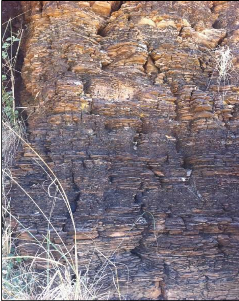
Barney Creek Formation (at 578749E 8143926N [MGA Zone 53 (GDA94)])