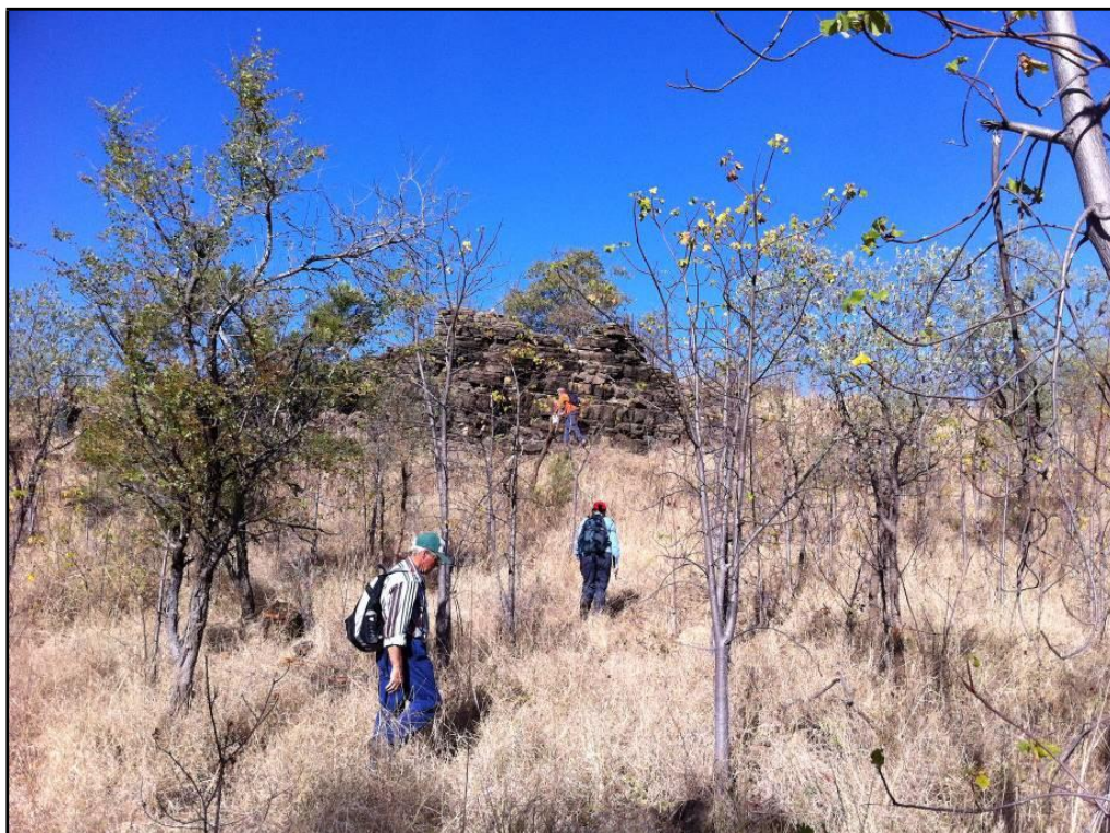
Teena Dolomite (view to south from 578804E 8143758N [MGA Zone 53 (GDA94)])