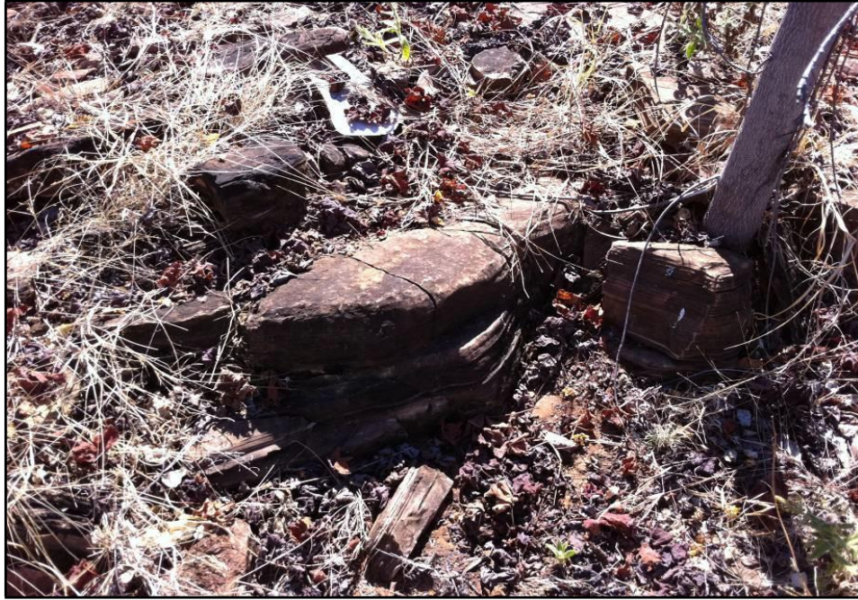
Barney Creek Formation (at 579865E 8144524N [MGA Zone 53 (GDA94)])