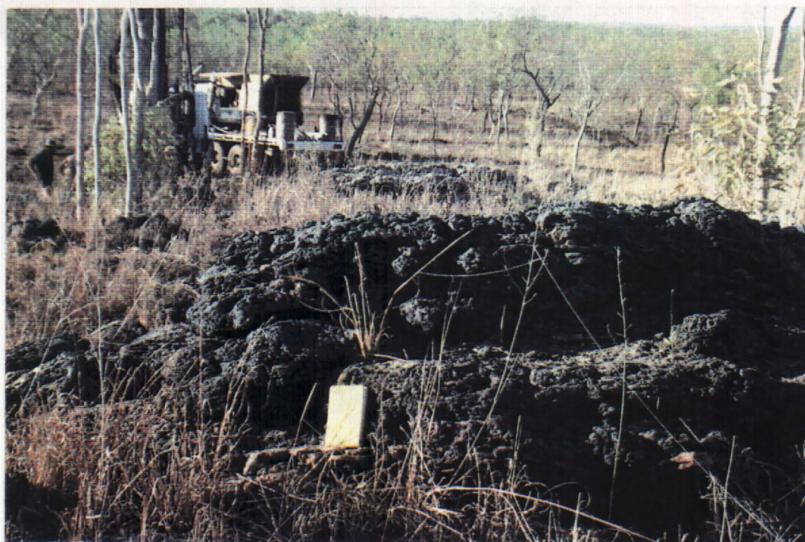
Photo 4 - Gently south-dipping chert manganese 20 m along strike from Photo 3 near collar of CHRC/3