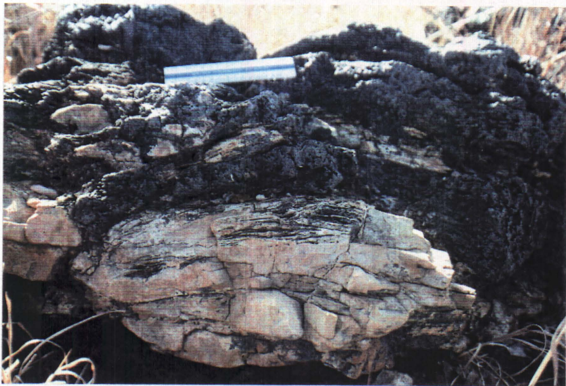
Photo 1 - Typical cellular manganese and laminated chert - scale is 150 mm long.