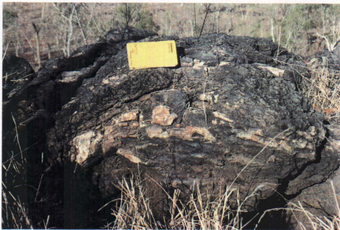
Photo 2 - Flat lying chert-manganese, 15 m west of S/10. Change in dip may be evidence of a shallow W plunging anticline - book is 200 mm long