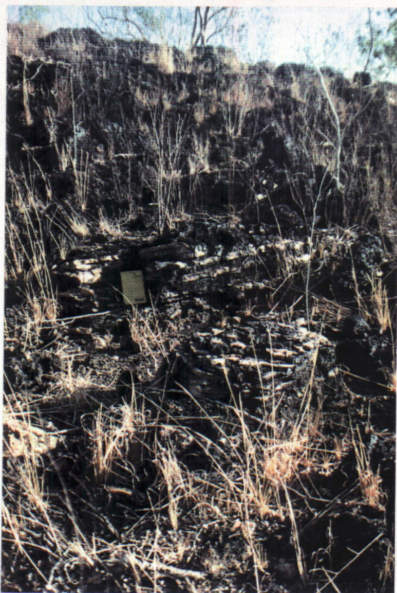
Photo 5 - Flat lying chert in manganese near S/10 - outcrop in Photo 2 is at left edge of Photo.