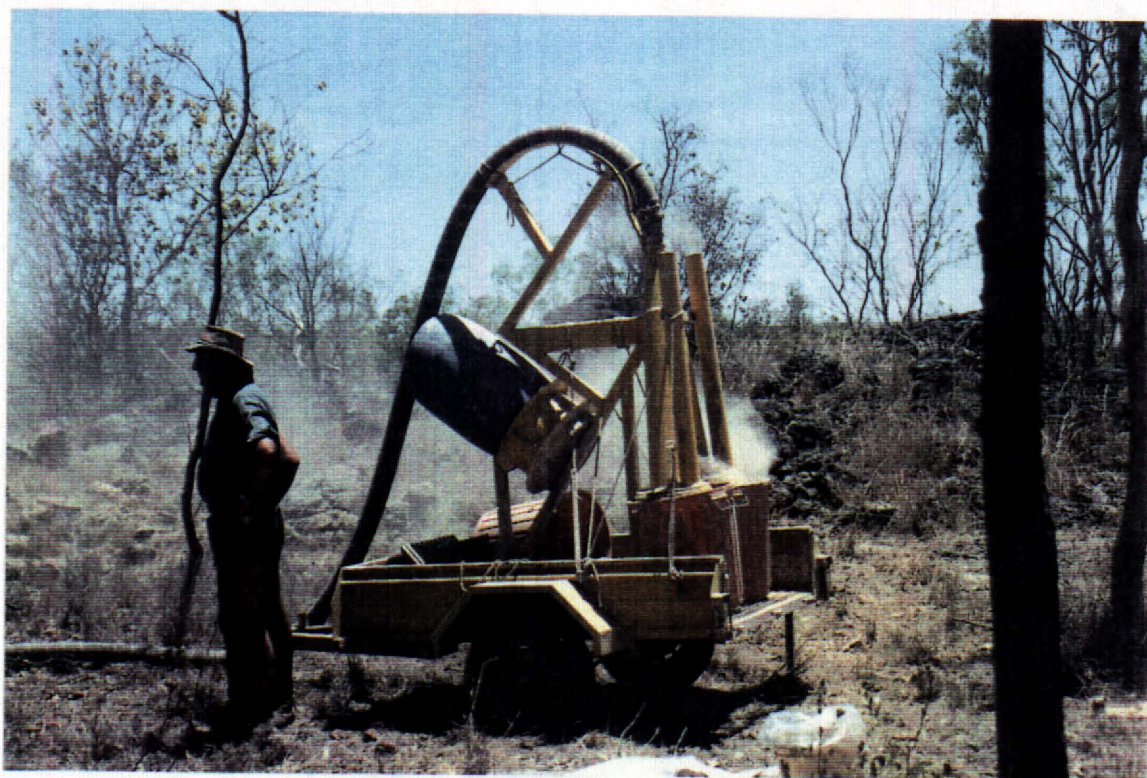
Photos 10,11 - Stadcote sample collector. Note excessive fine dust loss which is increased when hole is "blown out" at the end of each sample. Blue cylinder is exhaust of air-driven fan.