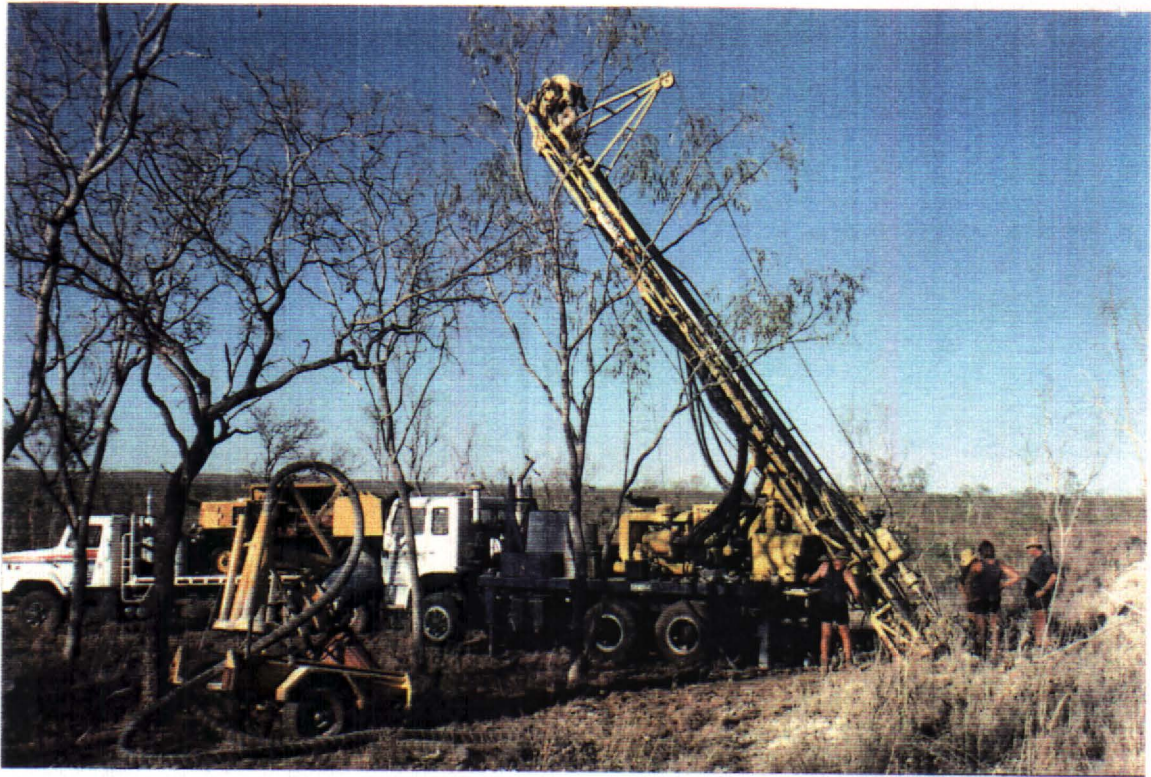
Photo 9 - Longyear GK 850 drilling rig and support equipment