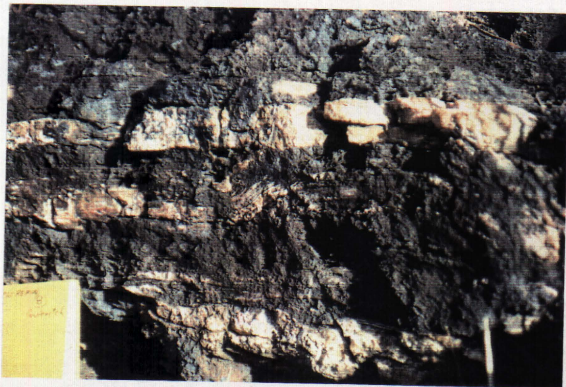
Photo 7 - Detailed view of chert and manganese relationship in outcrop of photo 6.