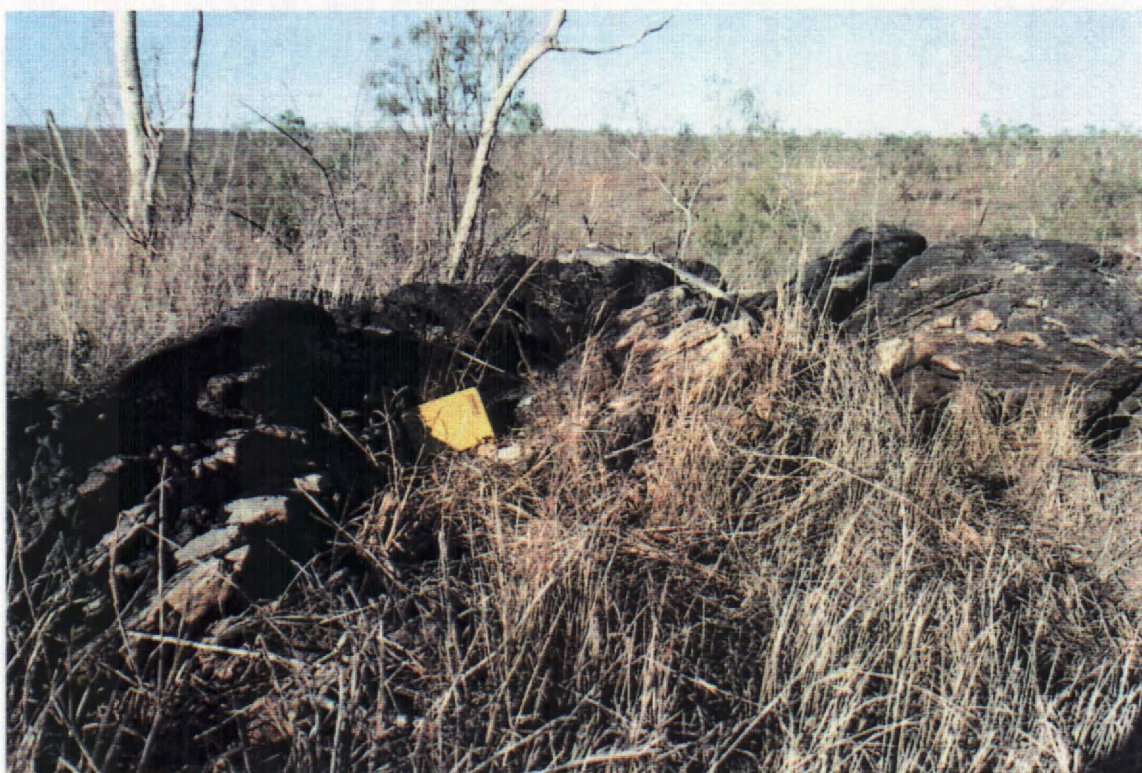
Photo 3 - South-dipping chert-manganese near S/10. Outcrop in Photo 2 is at right side of photo