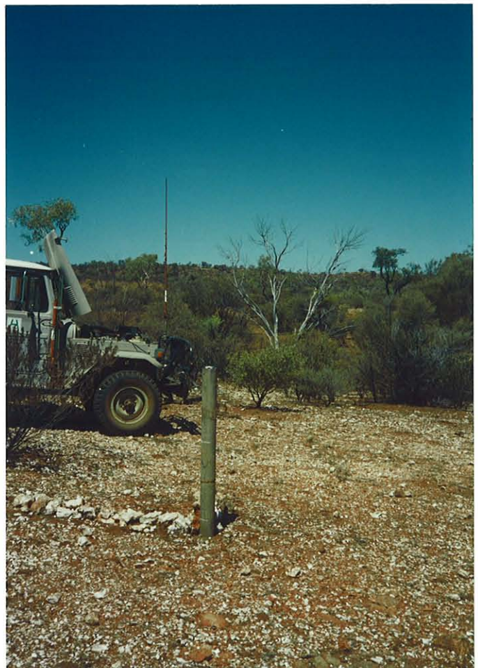
FIGURE 4b: Datum corner post, Gheko Prospect, after maintenance. View looking SSW.