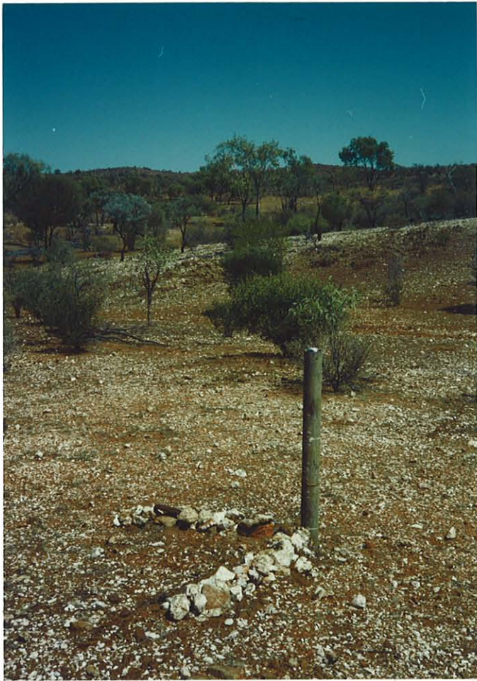
FIGURE 4a: Datum corner post, Gheko Prospect after maintenance. View looking SE.