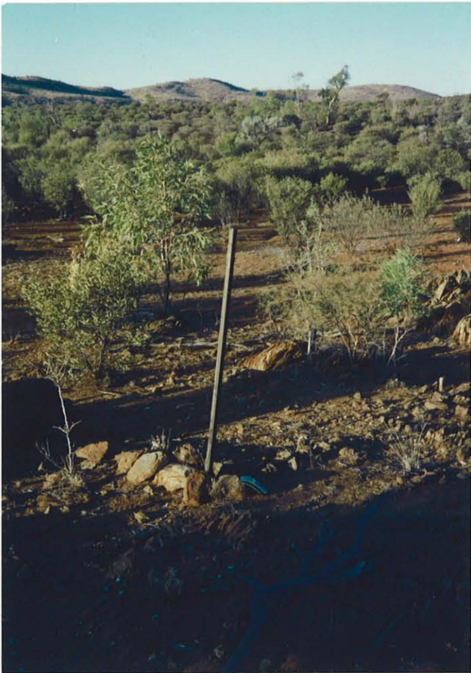
FIGURE 3a: Southwest corner post as found before maintenance.