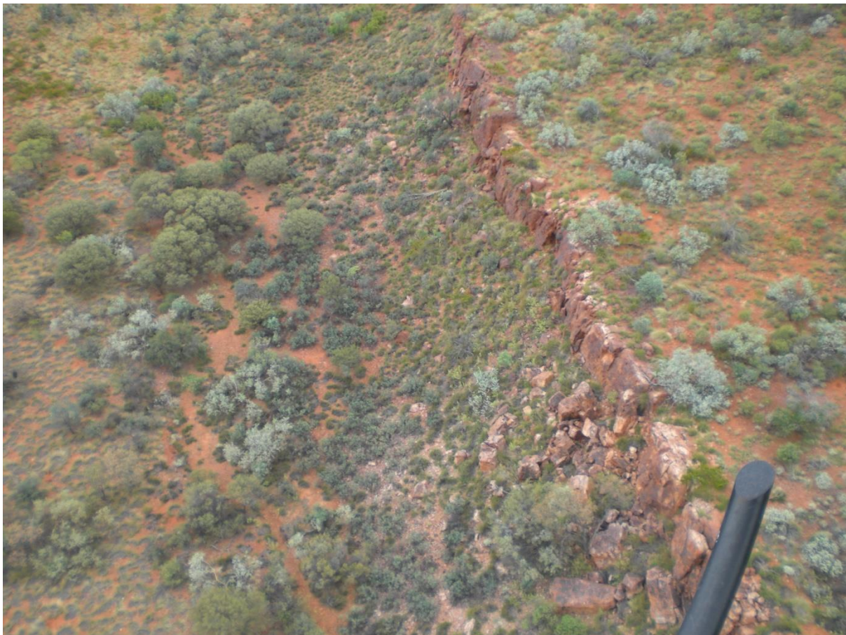
Traversing area by Helicopter prior to lease application

Mioxide NT decided not take on further exploration requirements in this difficult terrain as we have become largely focused to move to production of Iron Oxides from our current granted lease areas and need to stay focussed on our current Lease areas.