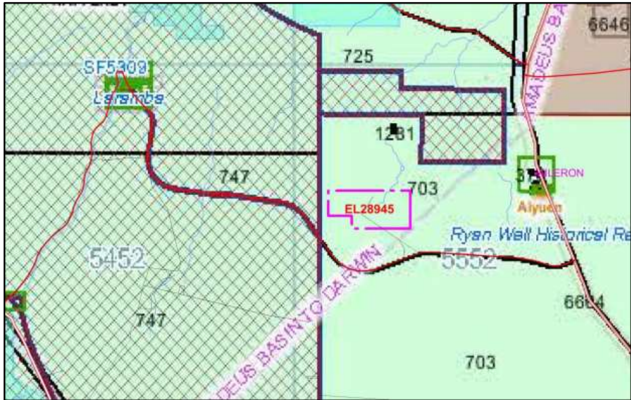
Figure 3 Landholders and Lease Numbers displayed inside EL28945

The region has a semi-arid continental climate. This following description is drawn from Stewart (1982):“The climate is characterized by long hot summers when temperatures regularly exceed 40°C, and short mild winters. The average rainfall is about 280mm, most of which falls between November and March, but both frequency and amount are erratic.” (Stewart, 1982)