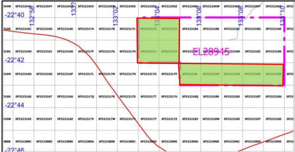
Figure 2: Graticular blocks covering EL28945(red blocks reduced)

second reduction period, the EL's area is 10 graticular blocks (31.69 sqkm, Figure 2). There are no other mining leases or mineral claims within the Licence area. List of Graticular blocks covering EL28945 in Table 1.