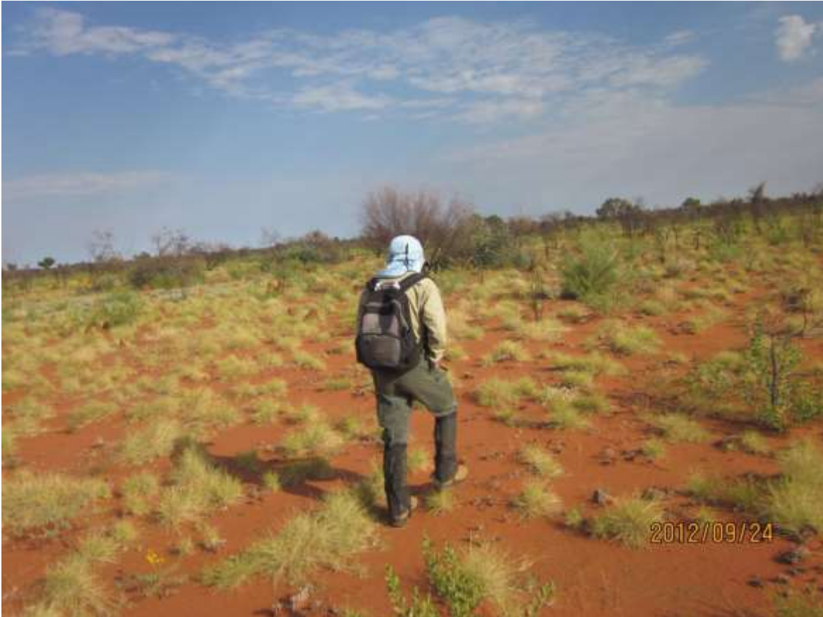
Photo1 Aeolian sand (eastern of EL28945)

Reconnaissance field trips. These field trips traverse included discussions with pastoralists. Access around the area was also assessed. The lease almost cover of with Aeolian sand (photo1), there is a little bit late Proterozoic Quartzite around edge of Ngalia Basins. No sampling was undertaken.