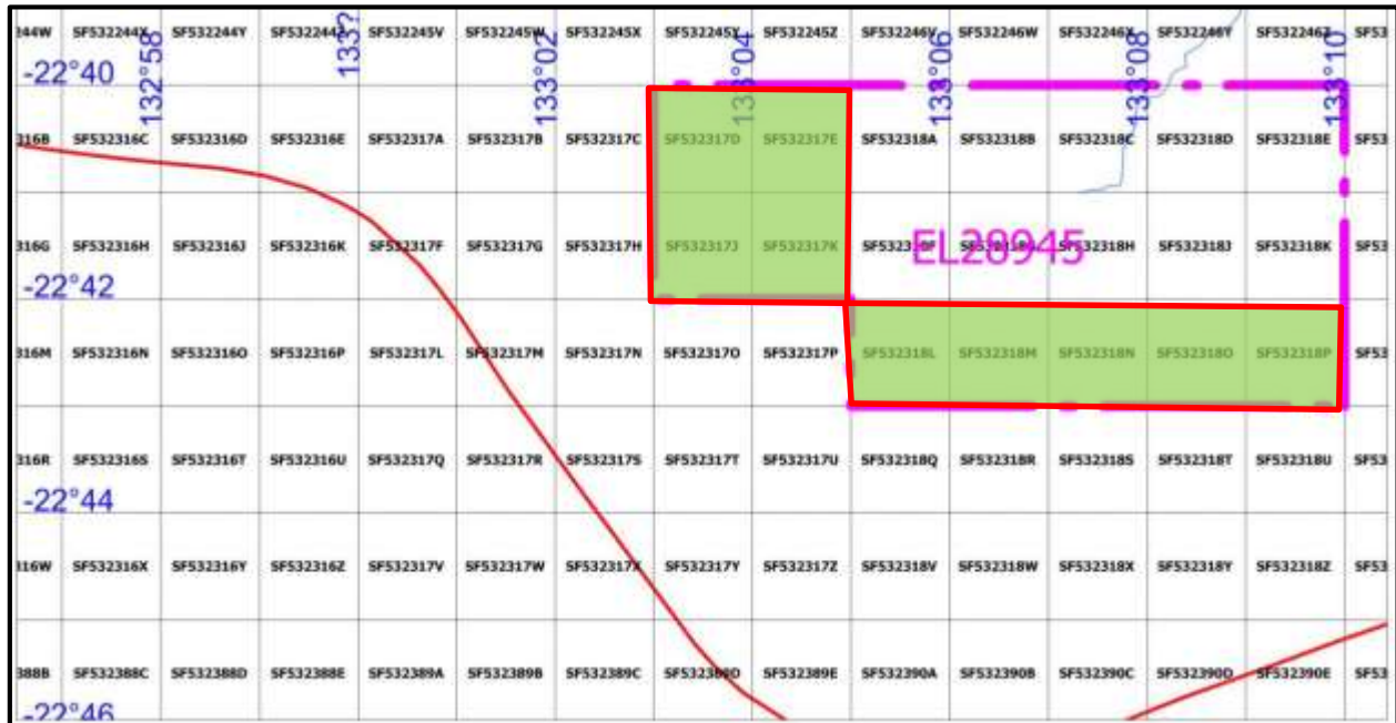
Figure 2: Graticular blocks covering EL28945 (red blocks reduced)

There are no other mining leases or mineral claims within the Licence area. List of Graticular blocks covering EL28945 in Table 1.