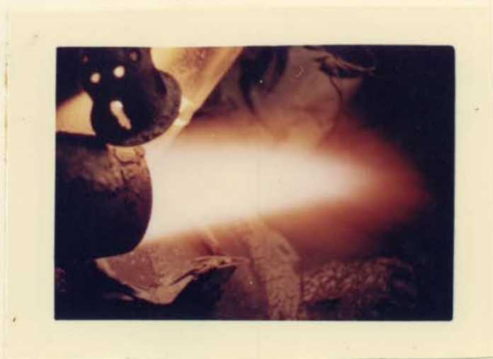
Exoil Gosse's Bluff No. 1 Well Gas Flare at Blooey Line at 3,090 feet