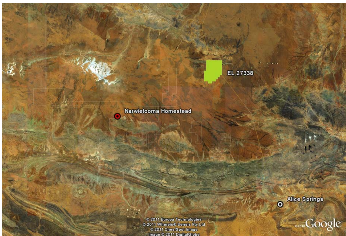
Google Earth Image illustrating the regional location of EL 27338

Compiled: Buskas M Tenure Holder: Crossland Nickel Pty Ltd Submitter of Report: Crossland Uranium Mines Pty Ltd Date of Report: 17 April 2012